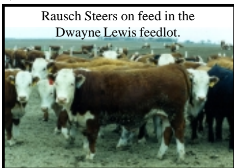
Rausch Steers on feed in the Dwayne Lewis feedlot.

Montgomery County Iowa purchases from 20 to 30 club calves annually from Rausch Herefords. 4H members draw lots, keep records, show the steers and collect carcass data through the CHB program to earn over all champion.