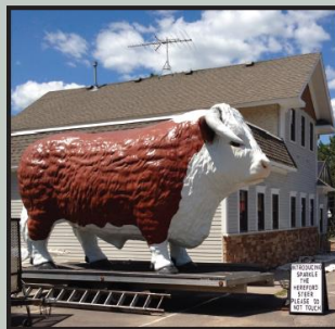
The Lake Elmo Inn, Lake Elmo MN