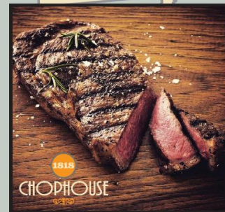
1818 Chophouse, Edwardsville IL