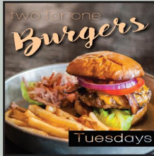
Sky's Fine Dining, Grand Forks ND