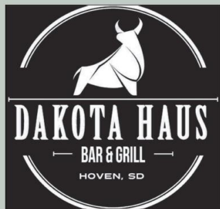
Dakota Haus Bar & Grill, Hoven SD

Please ask if your restaurant is still serving Hereford. If they are, please thank them and if not, please ask them why!