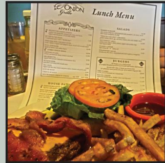
The Onion Grille, Hastings MN